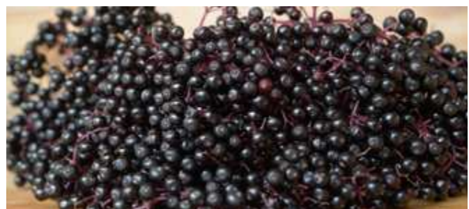
Harvested elderberries, Wisconsin.

For the two annual commodity crops, this analysis showed no decline in suitability by 2050. There are modest expected increases in suitability for corn by 2050, while soybeans have significant increases in suitability by 2050. Of the emerging crops, elderberries and hazelnuts are expected to have 20% more suitable acres by 2050, although some of this will be offset by small areas of declining suitability. Aronia is also expected to see increased suitability at a lesser scale (6% increase in suitable areas) while blueberries, winter camelina, and Kernza® are not expected to see any change.