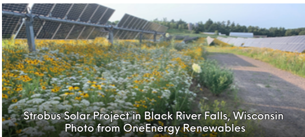
Strobus Solar Project in Black River Falls, Wisconsin

Solar farms with perennial groundcover allow heavily cultivated land to rest, providing a break from the pesticide and fertilizer use that comes with conventional agriculture. Clean Wisconsin's research shows that solar farms with native grasses and flowers planted among the panels improve water quality, provide habitat for pollinators, and regenerate soil health.