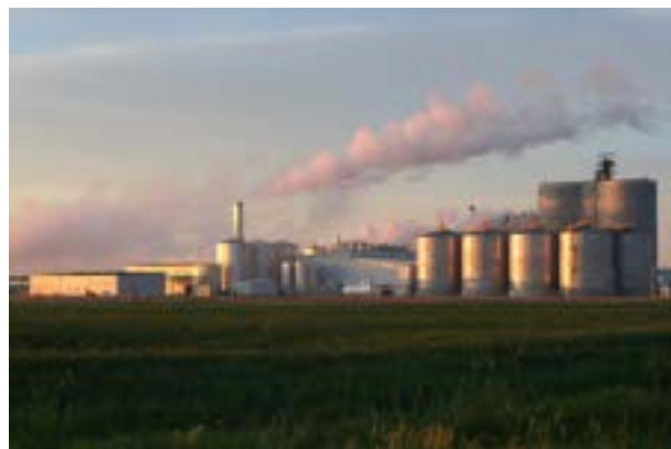
A corn ethanol processing plant in Iowa